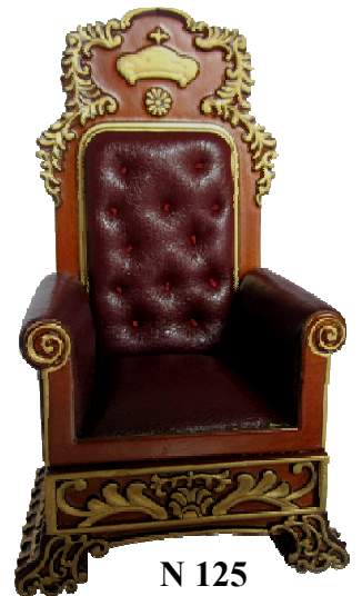
N 125 Regal Throne