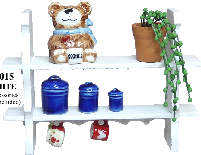
N 015 WHITE (Accessories Not Included)